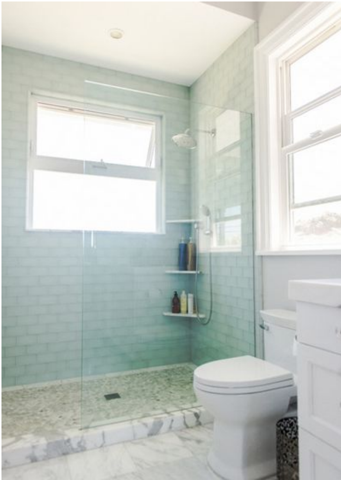
Showerhead: Rain, Grohe