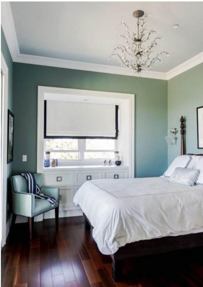
Audrey, Canopy Designs, ABC Carpet & Home